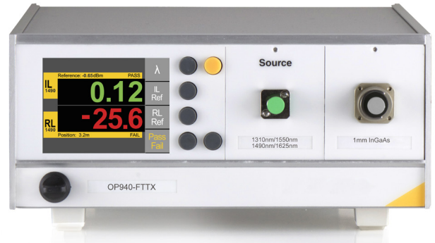
An OP940 benchtop insertion loss and return loss test set displaying color-coded ILRL test results

The OP940 system is an insertion loss (IL) and return loss (RL) meter that features a color LCD screen, an optical reflectance scan mode, programmable pass/fail for editable test criteria and on screen context help. Additionally, the OP940 can measure return loss (RL) at two positions simultaneously through the front panel and it offers expandable functionality. As with our other IL/RL systems, the OP940 measures RL quickly and accurately without the need for mandrel wrapping or the use of index matching gel, and is available in Single Mode, Multimode, and FTTX variants.