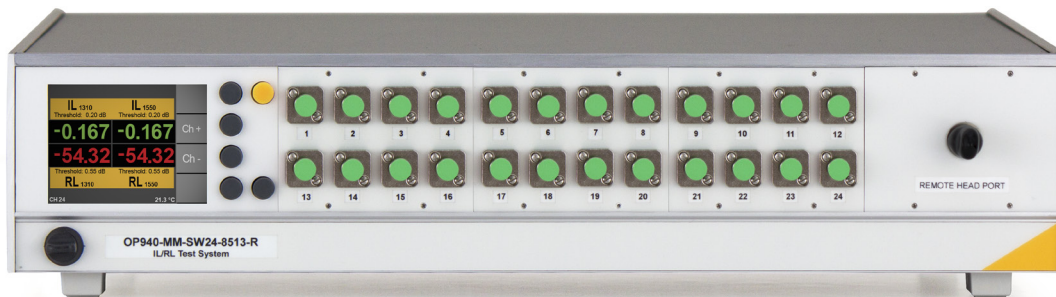
Model OP940-MM-SW24-8513-R Insertion and Return Loss Test Set designed for testing multifiber multimode cables

By incorporating a high-quality MEMS optical switch, the OP940-SW is able to quickly and accurately test multichannel cables. It can be built with 4 and up to 24 channels and all source connectors are easily accessible to minimize downtime on high volume production lines in case of optical endface damage.