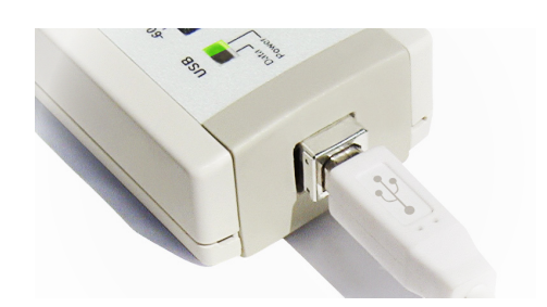
USB-powered and controlled

The USB-powered module connects directly to the computer. OptoTest provides drivers and applications that allow the user to perform common measurement tasks such as EXCEL data logging or time-stamped stability measurements.