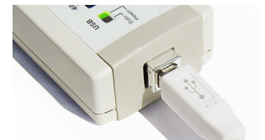
USB-powered and controlled