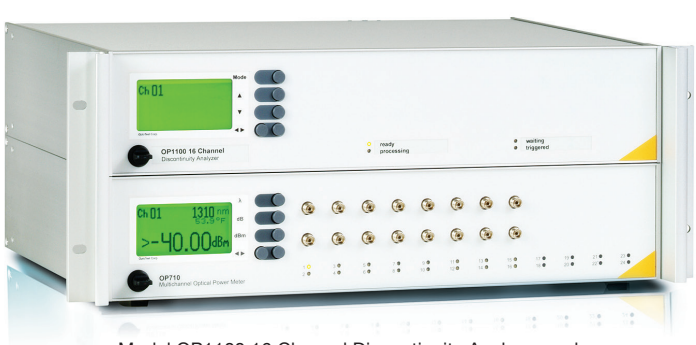
Model OP1100 16 Channel Discontinuity Analyzer and OP710 Multichannel Optical Power Meter

OptoTest's OP1100 has the distinction of being the only multichannel discontinuity tester on the market. With sampling rates up to 2.5MHz (0.4us per sample), a wide dynamic range, and selectable dropout thresholds, the OP1100 performs dropout testing on optical fiber ranging from single mode to POF. Its turnkey software allows the operator to set the dropout criteria, sampling rate, and saves all data to Excel files for easy analysis. The test set meets all necessary standards for vibration and shock failure tests, such as EIA/TIA-FOTP-32A, and works with our OP750 Multichannel Optical Sources or with an external optical source.