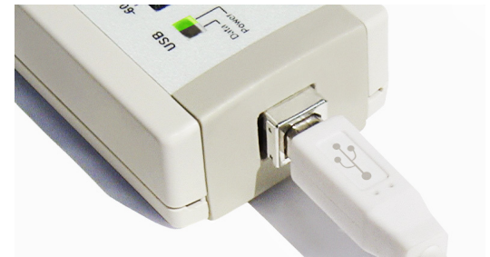
USB-powered and controlled