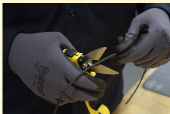
Cuts up to 4 AWG copper or aluminum wire in metal cutting blade