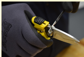
Round cutting notch for small-gauge copper or aluminum