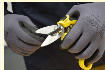
Ergonomic grip and rounded edges for repeatable cuts with no pinch points