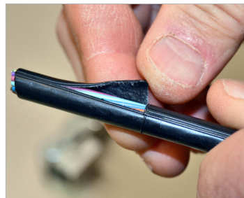
Factory-set, non-adjustable ripping blade "pops" the jacket open to easily peel back & expose the fibers.