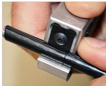
Precision ripping blade performs longitudinal cuts by slitting along the ridge of the cable jacket.