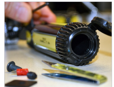
Handle conveniently stows tweezers, extra blades, screws & hex key for easy blade replacement.