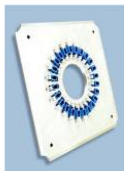
PH55-PL-24 LC/PC 24 connector fixture