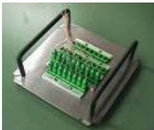
PH55-CP8A-32N SC/APC 32 connector fixture

Mega-axis I.P.C. Fixtures are available as well for FC, SC, ST, MU, & LC Up to 48 connectors polishing at once